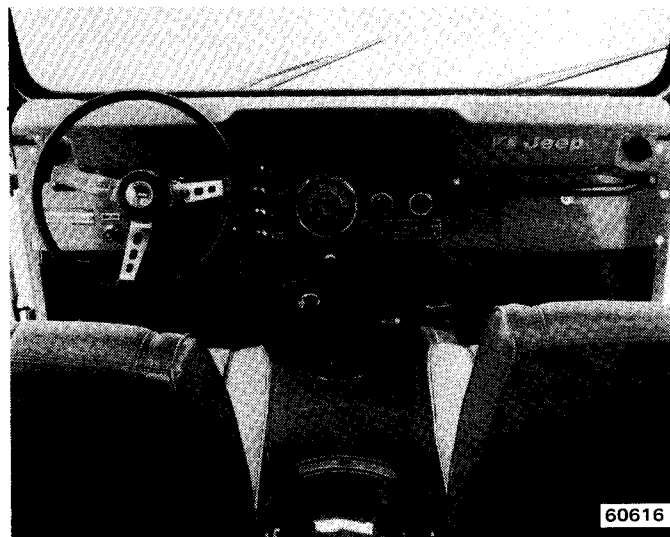
Fig. 18-2 Instrument Panel—CJ Models